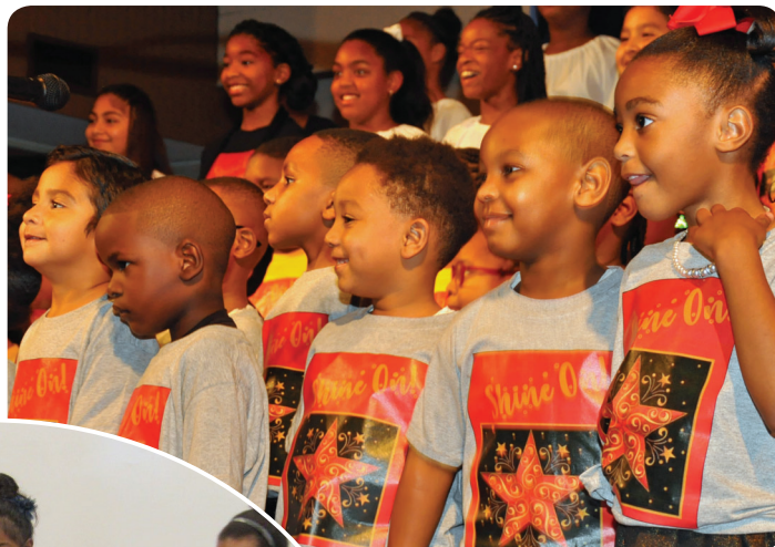
GREENWOOD – St. Francis of Assisi students learn why the smallest, most humble star gets to be the Christmas star at Jesus' birth in their play, "A Star is Born."