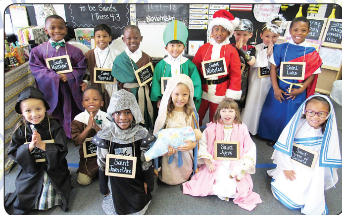
MERIDIAN – St. Patrick students sing about the saints they portray at the All Saints Day Mass.