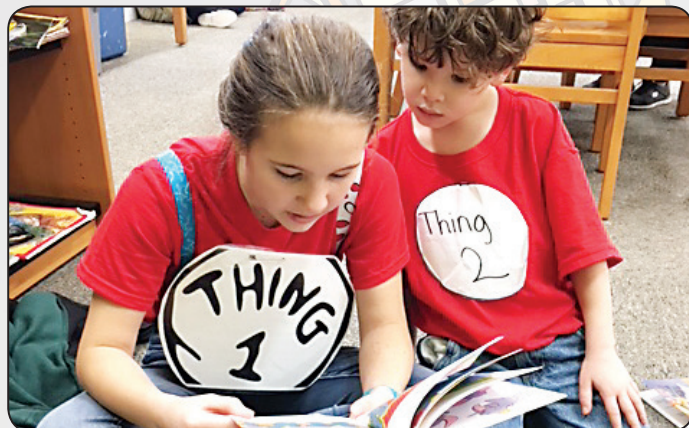
GREENVILLE – St. Joseph students act as reading buddies to their younger schoolmates.

Pre-K 3 thru 12 th grade 662-334-3287 662-378-9711