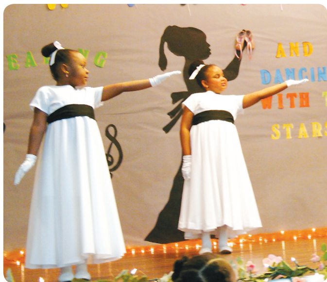
NATCHEZ – Holy Family Kindergarteners perform a praise dance at their 2018 graduation.