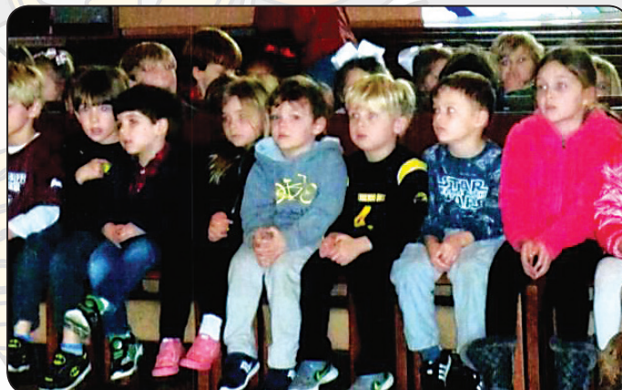
MADISON – Assisi Early Learning Center students visit the sanctuary of St. Francis Parish.