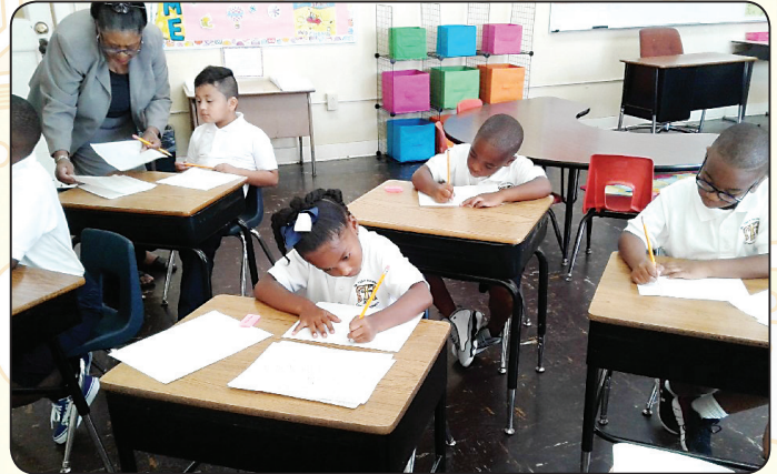
JACKSON – Sr. Thea Bowman students get right to work on the first day of school.

"Sister Thea Bowman School has been the right choice for my child. The religious teaching and prayers are taught in and out of the classroom. I love the one-on-one attention that my child gets if she needs it. She is challenged academically and isn't ignored or pushed to the side if she has an issue with a subject. This makes a difference when it comes to making sure that she not only knows the information, but is retaining what is learned. As a parent, I have a voice in the school. The concept of a three-way partnership is an important part of the way the school works."